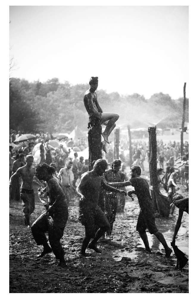
By Kai Teo buddhamag.org

You can take us out of Ozora, but you'll never take Ozora out of us You can take us out of Ozora, but you'll never take Ozora out of us