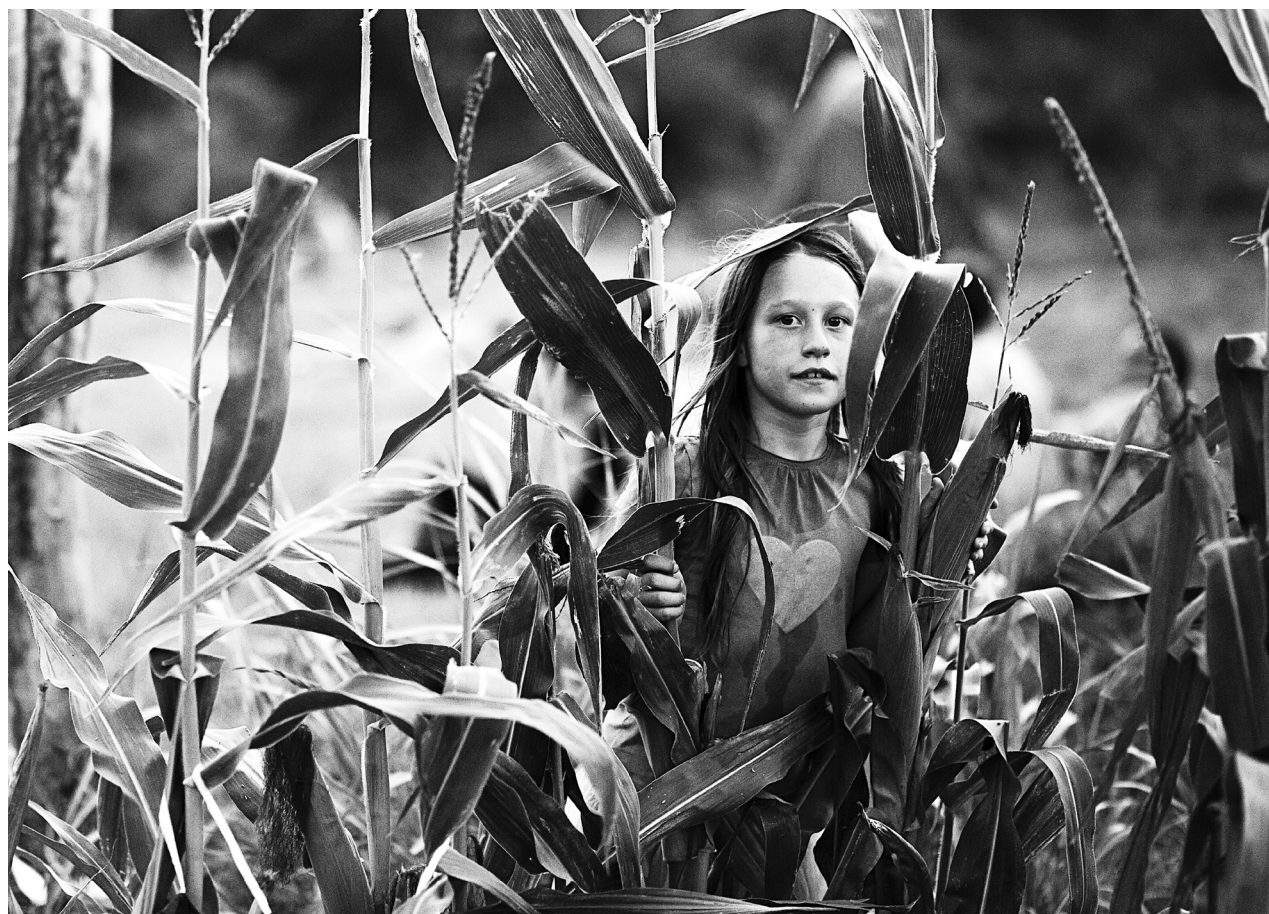
The Labyrinth awaits you each day, and its creatures with a special game and a journey you canntake.