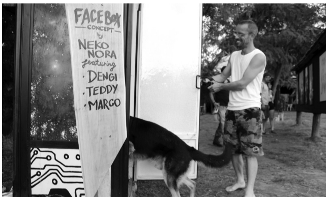
FACEBOX is an art project to create the freakiest and funkiest selfie collection of the Ozorian Tribe. Don't miss it! You can find the FACEBOX next to the MIRADOR!

Except Glowing Mandala workshop, ArtiBarn is hosting various other workshops that provide, on a daily basis, a heaven for different kind of artists from those seen on the dance floor. Woodcrafters, painters, technofreaks and mandala growers are among them.