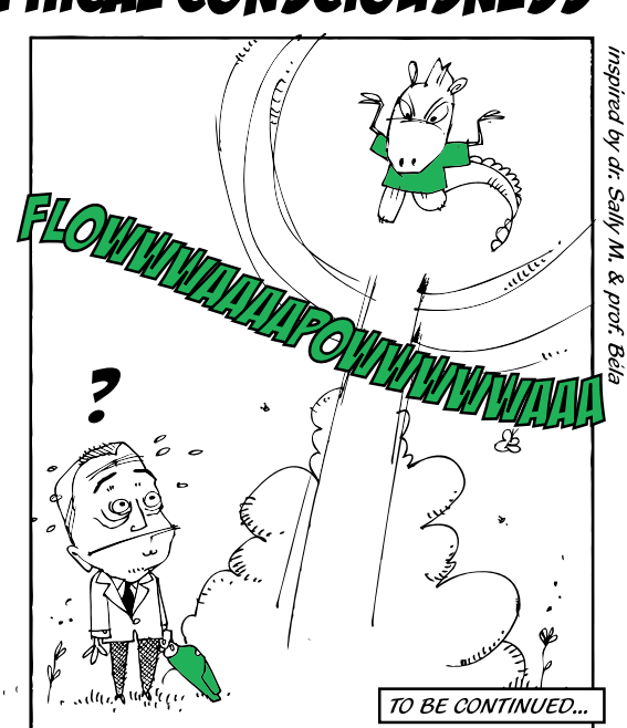
written by: novishari & — OLRAJT — illustrated by: torojo